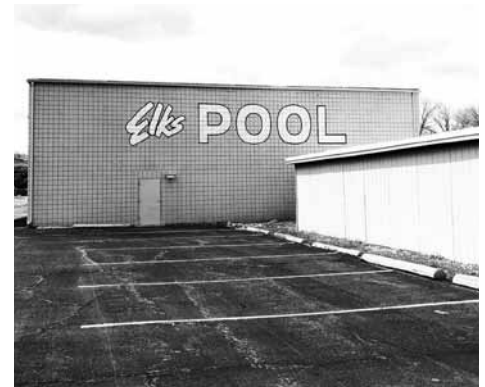
Winner of Details by verdiviewfinder