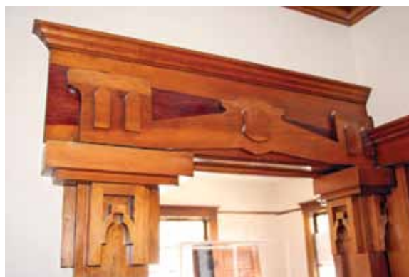
Porthole window on the front of the house (top). The intricate woodwork (above) found throughout the home.

Aside from the sentimental aspects of this home, this Asian-influenced Craftsman is stunning, with its porthole windows, dramatically upturned eaves and the intricately-carved symbols atop the porch posts (see photos this page and next). Constructed around 1910, the style is architecturally significant to Reno. Craftsman was the