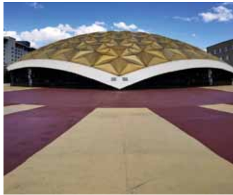
Winner of Best In Show and Public, by basinlightphotography