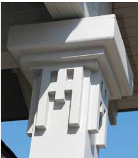
Exterior details of Asian-influenced Craftsman on porch pillar and roof.

As for the home's basic construction, if you have ever planned a project using