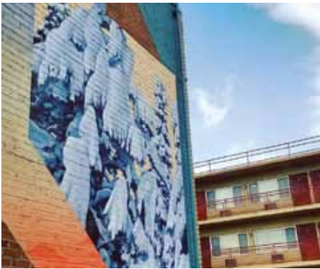
Winner of Commerce by kelsey3000