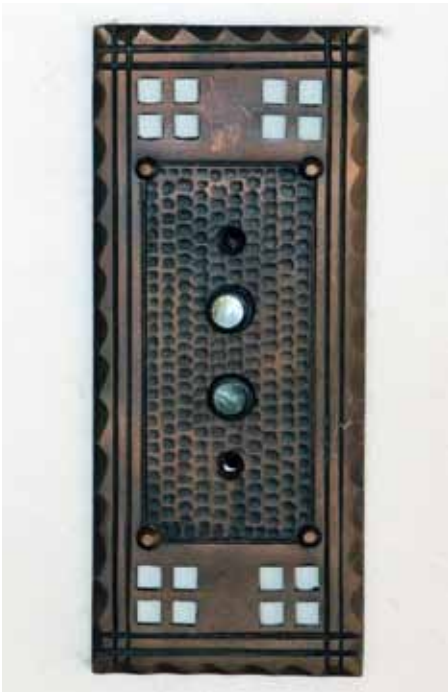
The push button light switch.

hallmark of Gilbert-restored homes cannot be over emphasized. As the original bathtub had long been replaced, the Gilberts found a 1917 bathtub weighing 325 pounds to complement the bathroom. Tim pointed out that if you add a 200-pound person and 100 pounds of water, the weight would seriously stress the average floor. The bathroom floor has therefore been reinforced.