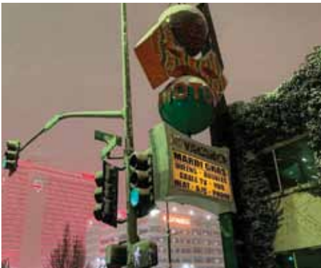
Winner of RIP by keeprenodirty