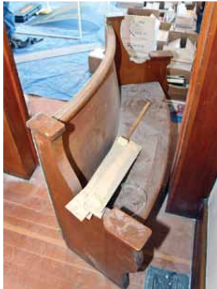
One of the curved benches under repair.

2x4 lumber, you know it's never actually 2" by 4". But the Humphrey House is full of 2x4's that really are still that exact dimension and Tim has recovered additional vintage 2x4s used in the new bedroom. Many of the windows are original, such as the "portholes," and others which feature 12 lights over one, or 16 over one. Those needing replacement will be of a similar style.