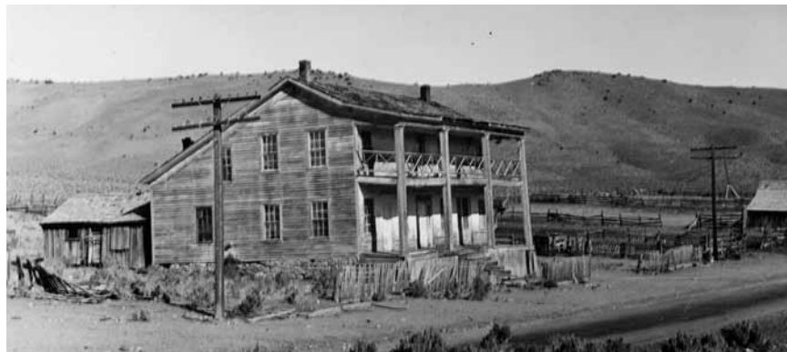
The Evans Ranch, Long Valley, Lassen County, California Occupied by the Evans family 1853-1883.